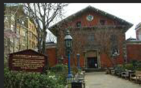
GARDEN OF ST PAUL'S

Still walking, we crossed the famous Millennium Bridge to St Paul's and then walked down Ludgate Hill and up Fleet Street to Aldwych and on to Covent Garden . By now we had been walking for almost four hours, apart from the 40 minute river cruise. We were all just a little tired, so we took a rest in one of London's hidden treasures, the lovely garden of St Paul's Covent Garden. Known as the actor's church, this tiny oasis of calm is right in the middle of one of London's busiest tourist spots.